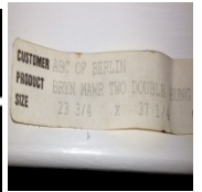
Right Close Up Photos (s)

5. *Glass Issues: Indicate visible glass sizes & quantity. Window 1 Height _____ Width _____ Qty _____