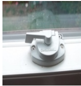
Front Close Up Photos (s)