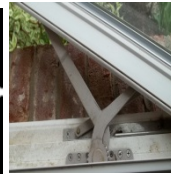
Left Close Up Photos (s)